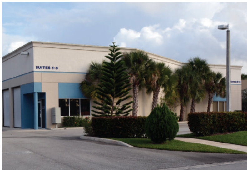
Jupiter, FL USA

Jupiter, FL 33458, USA | Contact: 1-833-783-ATLC (2852) | +1 (561) 295-5433 e: sales@atlcorporation.com | www.ATLCorporation.com