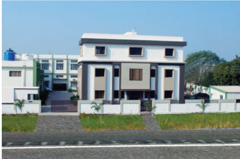
Manufacturing facility in India